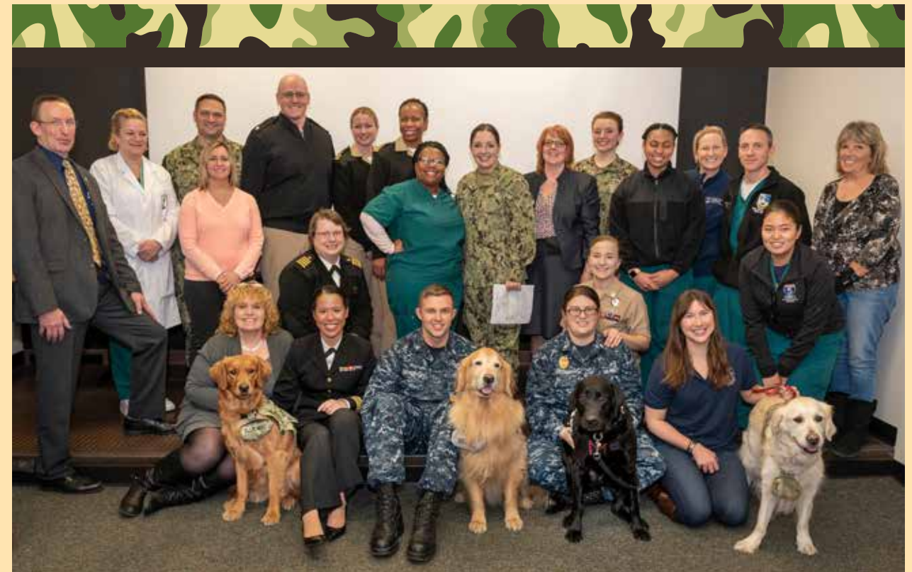
The team at Walter Reed National Military Medical Center

WALTER REED NATIONAL MILITARY MEDICAL CENTER